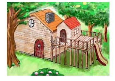
Exciting tree house and family cottage

Visitors can dress up like the Chocolate Rabbit girl or the Walnut Squirrel boy to feel like a member of the Sylvanian Family and enjoy their time at the village.