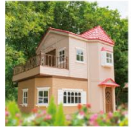
Large Red Roof House